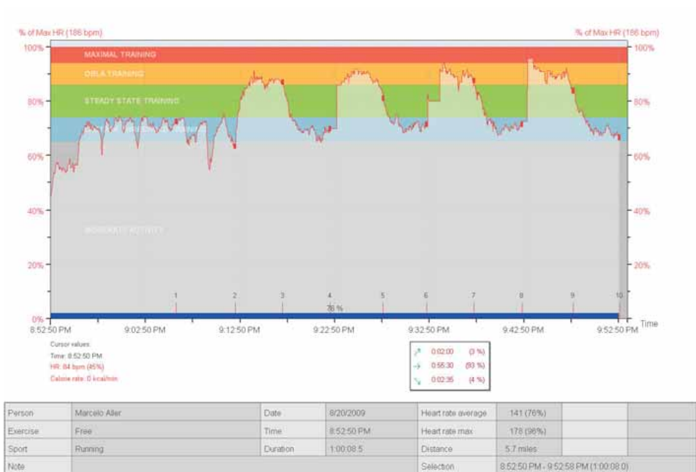
Table 1. Sample Summer Conditioning Program