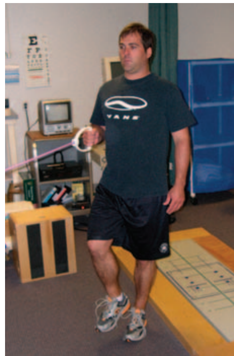
Figure 4. Single leg balance with one arm row