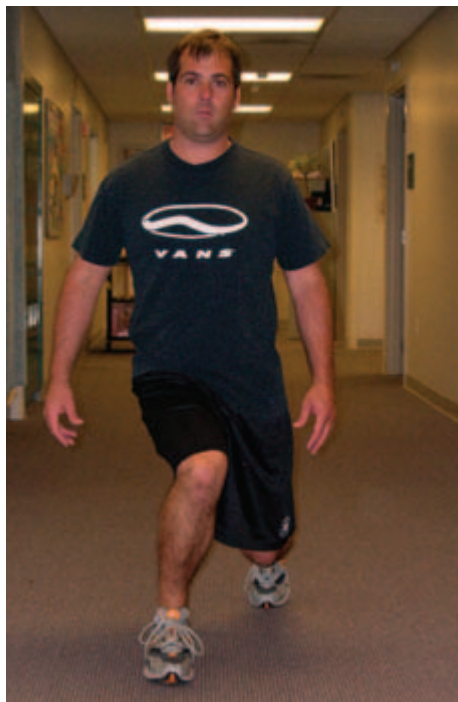
Figure 2. Poor lower extremity biomechanics observed during a lunge