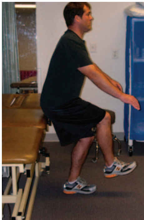
Figure 1. Single leg squat test