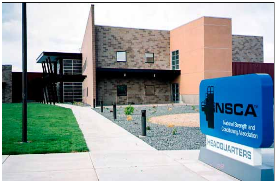
NSCA World Headquarters