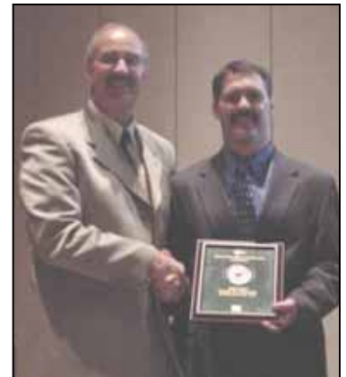
Patrick McHenry wins the SCJ Award